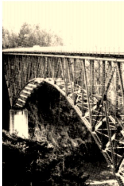
Deception Pass in Washington State

The stretch from theory and model into daily practice is rarely addressed by those who bring new technologies and networks into schools, but the distance is vast. Moore (1991) writes about