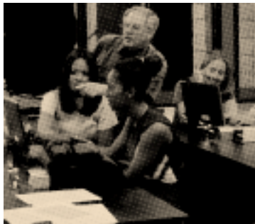
Teaching science in a laptop classroom in Antelope Valley, California

When a student or teacher sits down at any desktop in the district, they should be greeted by a rich information array.