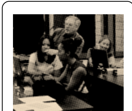
Teaching science in a laptop classroom in Antelope Valley, California

The lessons learned and the problems avoided thanks to a year of